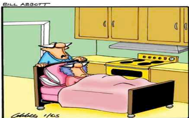
“I figured you should have breakfast in bed on your birthday. Can you reach the stove okay?”