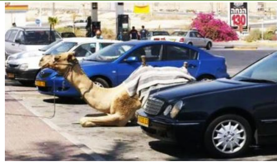
THE PERFECT PARKING JOB!